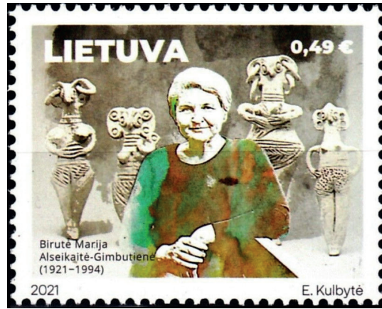
Figure 1 Maria Gimbutas 100 (a stamp from Lithuania)

In 1949, the young family received permission to settle down in the United States. The move to New York marked the first step in Marija Gimbutas' remarkable career in the New World. Soon after their arrival, Gimbutas began working for the Department of Anthropology of the Peabody Museum at Harvard University in Boston/Cambridge, where she spent the next fifteen years. Although it must have been difficult to navigate the male-dominated acropolis of the Ivy League, especially for a woman with a