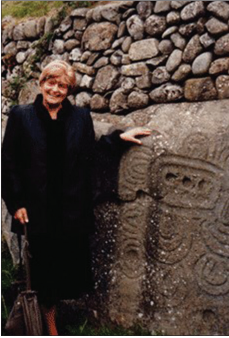
Figure 5 An ultimate photo from Newgrange, 1989

uments in the Boyne Valley, but I often had to step aside when people wanted to take a photo of her. She suddenly turned to me and said that they were taking the pictures because they thought that they could well be the last photos of her (Figure 5). This was our last meeting. She died after a long-lasting illness in 1994.