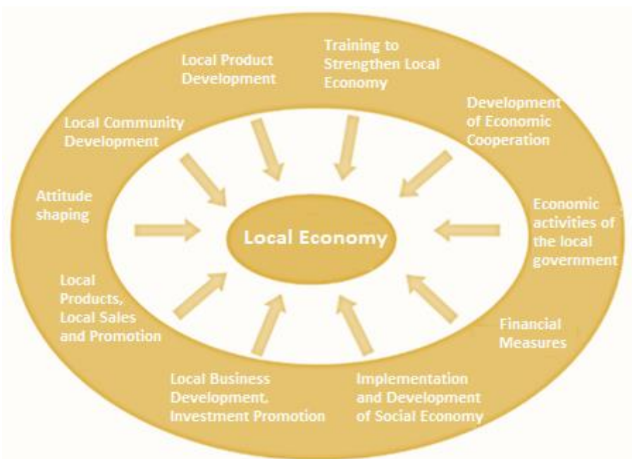
Figure 1. Local economic development instruments

Based on the situation analysis and diagnosis made in the earlier phase of the project, the instruments of the local economic development strategy are built on local resources, keeping in mind the need for sustainable growth and development. The local economy can be developed with human, financial or infrastructural means. Obviously, the most effective way to create a model could be to use as many tools and methods as possible, building on each other to form a consistent program.