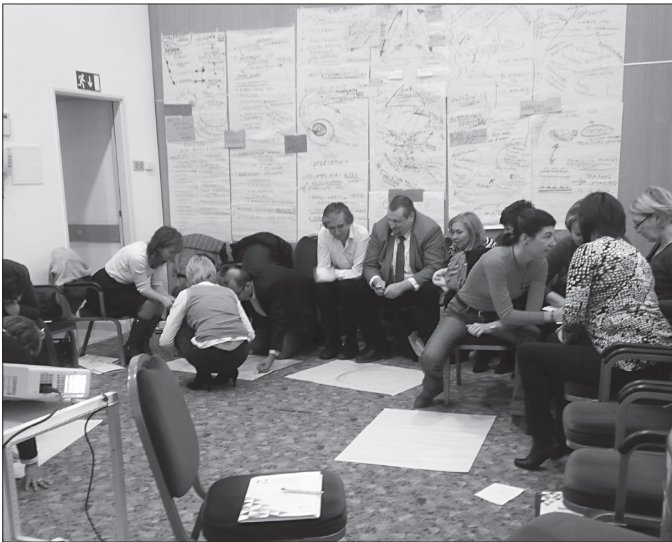
Figure 1 • The the work and the wall with the group memory

These definitions, methaphores and schemes are recorded on flipcharts together with records of the process that engendered them. During the training the flipcharts are posted on the walls. They are reminders of the common journey. The wall is the group memory that helps participants consolidate the relevant knowldege, remember the connected emotions and reflections, and build them all together to support a change in attitude.