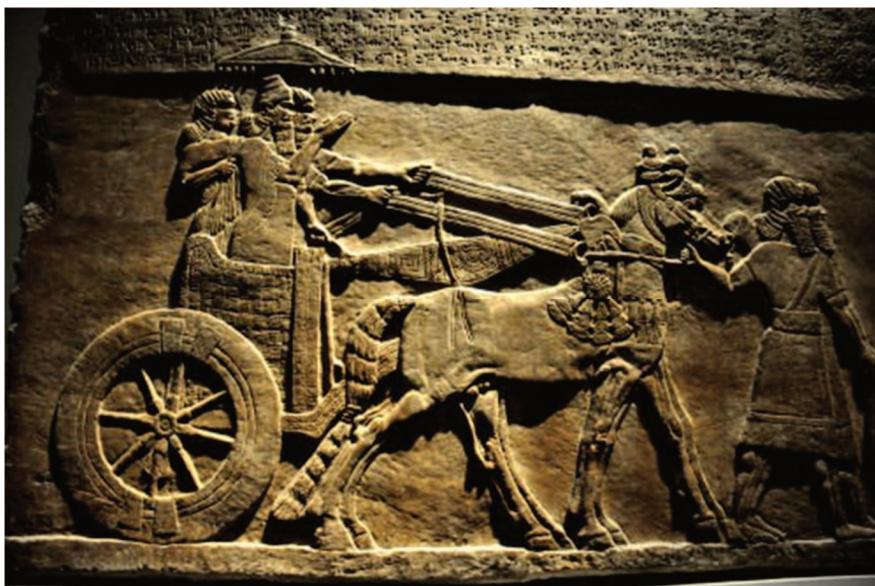
Figure 3. Chariot

The spear was the main weapon, as it could penetrate any armors with extreme accuracy. Most known spear was the sarissa . It had double length compare to the spear. It was also very useful against cavalry.