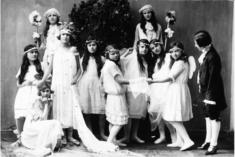
Figure 4. Fortepan code: 85044