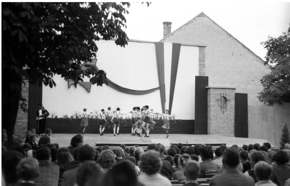
Figure 2. Fortepan code: 79249

Celebrations of folk dances were common in schools. This is supported by the photographs in the school bulletins of the period, among others. The photo was taken in 1949 in the common courtyard of the Budapest Primary Boys' School in the capital and the Pannonia Street Primary Girls' School in Budapest. Schools often staged dance shows, which were presented to a wide audience in exchange for ticket purchases. In the enlarged version of the image, the dancers are dressed in Tyrolean costumes. The boys are wearing bridle shorts, a white shirt, a similar bridle skirt, and a white blouse with a hat on their heads. Most schools sought to introduce young people to the traditional dance of several nations. The Tyrolean dance was popularly edited because of its unique melody and style. The learning of couple dances was especially important for young people, as the students were able to prepare for social events after their life in School, which included dancing and getting to know men.