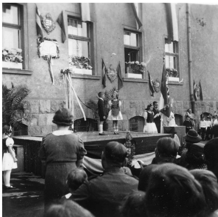
Figure 1. Fortepan code: 153126

From a ritual point of view, the most unique celebrations in school life are the year-opening and end-of-year occasions, national holidays, Christmas, Easter. The first selected image was taken in 1937. The event can be a school-year opening celebration or a national holiday. On the stage, two young students in national attire recite. The enlarged image clearly shows the girl wearing an ornate coronet, a vest, and an apron, with two other pupils holding the school flag next to them. Among the audience, we can see children, adults, who can be parents of children, so we can assume that this is a celebration that is also open to parents, which is of particular importance to everyone.