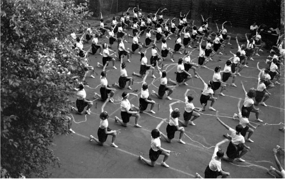
Figure 7. Fortepan code: 74917