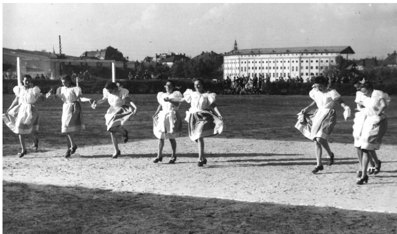
Figure 5. Fortepan code: 94067

Learning dances has become central to the upbringing of girls. Moreover, the presentation of traditional folk dances was not limited to performances only. The above picture was taken in 1938 in Budapest, in the courtyard of the Royal Hungarian College of Physical Education. The girls entertain the participants during a break in a sporting event. They present a traditional women's folk dance, thus strengthening national consciousness and belonging to the community. Dancing outdoors gives a more informal effect to otherwise regulated traditional dances. For a long time, sporting events were accessible exclusively to men because they believed women could not participate in such events. Then, at the turn of the century, sports facilities were expanded for ladies. Furthermore, the ever-expanding possibilities have created opportunities for students to find the right way to move.