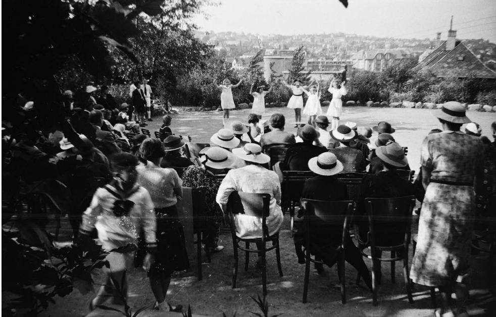
Figure 3. Fortepan code: 83949

In addition to traditional folk dances, more modern dances were an eruption of regulated dances (Németh, 2013; Boreczky, 2013; Boreczky & Fenyves, 2015; Fenyves, 2016). Antiquity, purity, and originality can also be seen here as a life-changing motif that includes an untainted form of dance, costume, and customs. In nature, in this case, the scenes danced in the schoolyard embody the desire to return to nature. The more informal dance structure is illustrated by the above image, which was taken in 1938 in Budapest in the courtyard of the New School in the 12th district. A large audience attended the school ceremony. The dance show consists of a group of young girls wearing light-colored, light-material dresses with a flower wreath on their heads. The fabric and tailoring of the dress allow for easy movement. The details of the performance, the dances, the movements, the story were often made by the children. Here we can see examples of something similar.