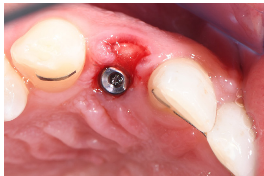
Figure 8 Implant with slow-resorbing collagen sponge on buccal side.