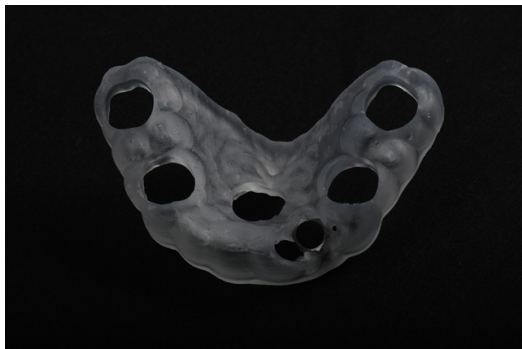
Figure 4 Tooth-supported surgical template.