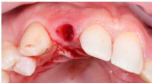
Figure 5 Surgical site after deciduous extraction.