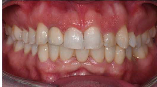
Figure 11 Patient final smile after 6 months.