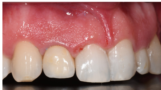
Figure 10 Final metal-ceramic crown and direct restoration of I. I.