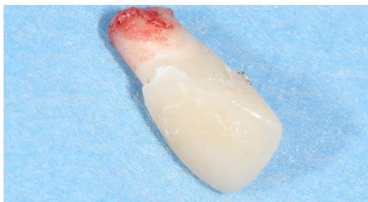
Figure 6 Deciduous tooth root resorption.