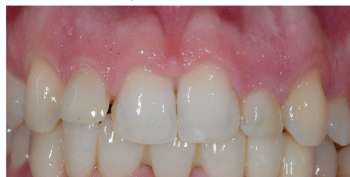
Figure 1 Patient initial smile with deciduous tooth 52.

All the prosthetic elements have been manufactured by the dental laboratory “Dentalibra” (Figures 1-12).