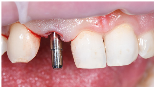
Figure 7 Milling position control Pin.