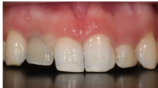
Figure 9 Provisional HIPC Crown.