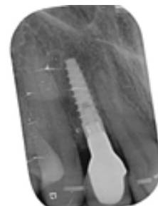
Figure 12 Final RX at 6 months.