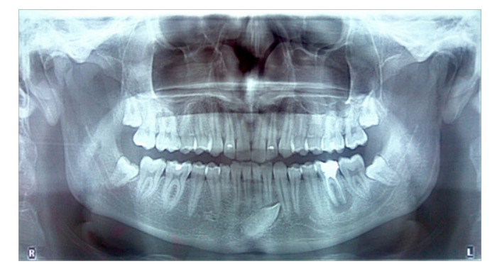
Figure 2 OPG showing Type I mesio-angular transmigrated mandibular right permanent canine (27).

A 22years old symptomatic male patient, was referred to our dental clinic presenting a transmigrated mandibular canine. During oral examination, crowded mandibular incisors, as well as a missing right permanent canine (27) and an over-retained right deciduous canine (R), were observed. Panoramic examination revealed a mesioangular transmigrated mandibular caninetype I (Figure 2). Due to the crowded incisors and insufficient space in the arch, surgical extraction with local anesthesia was performed. Under informed consent of the patient and strict aseptic conditions, a traditional bilateral inferior alveolar nerve block was administered to anesthetize the mandibular nerve 1.2mL of Roxicaina® (2% Lidocaine with 1:80.000epinephrine). Semilunar incision and dissection of the flap was performed. Pericoronalostectomy and cross-sectioning of the crown was done. An additional surgical window was performed to preserve midline and tooth extraction was carried out. The socket was filled with particulate bone mixed with Platelet-enriched fibrin glue and a PRF membrane was placed on the grafting (Figure 3). Finally, healing by first intention was facilitated by continuous suture. After 8days, control was done and the patient reported mild pain, swelling, trismus and hematoma in the mental region. Orthopantomographywas taken 6months after procedure (Figure 4).