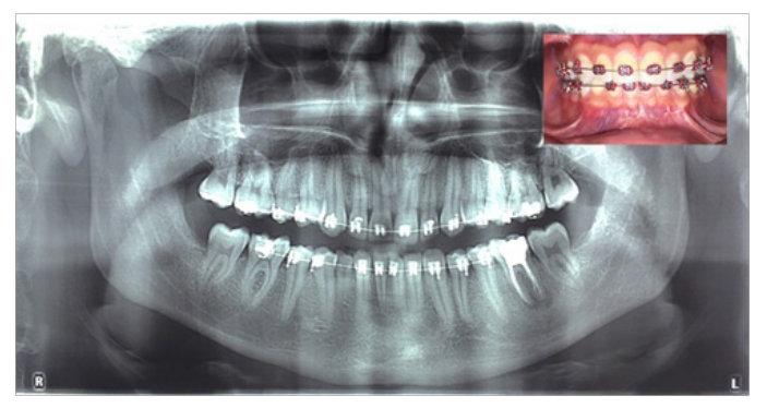
Figure 4 OPG taken 6months after procedure.

Different approaches of tissue regeneration have been used, in which an ideal bone graft should allow for new bone formation, including osteoconduction, osteoinduction and osteogenesis. Autogenous bone graft has those properties; however, it is indispensable to perform another surgical procedure, and it can increase infection risk, cost and time of the procedure.<sup>12</sup> The improvement of common postoperative complications, osseous defects and commitment of mandibular symphysis contour with platelet-enriched fibrin glue and platelet rich fibrin (PRF) has been seen as an excellent scaffold for tissue engineering due to the initial stability, biocompatibility, biodegradability and constant release of growth factors of the PRF, which allows mesenchymal stem cell (MSCs) migration, mineralized differentiation and faster angiogenesis.13 Likewise, according to Kökdere et al.14 combination of particulate bone graft with PRF promotes a greater mean area of newly formed bone compared with the PRF alone.<sup>14</sup> To have better outcomes in procedures of this nature, one should perform sulcular incisions, periosteum and symphysis cortical midline preservation and grafting with bone substitutes and