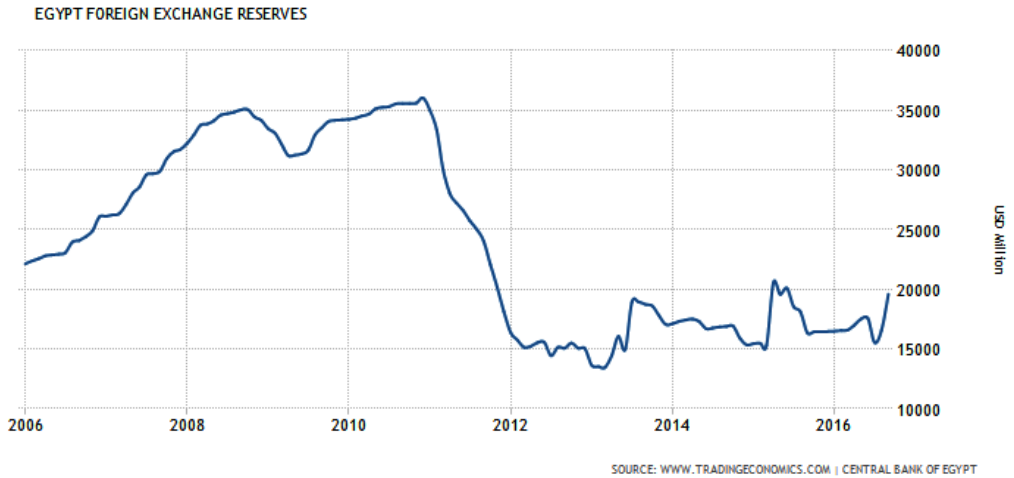
Figure 1. Foreign reserves of Egypt 2006-2016 (M USD)