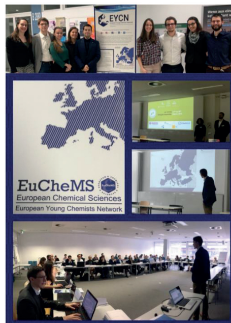
EYCN Delegate Assembly, Bremen, Germany