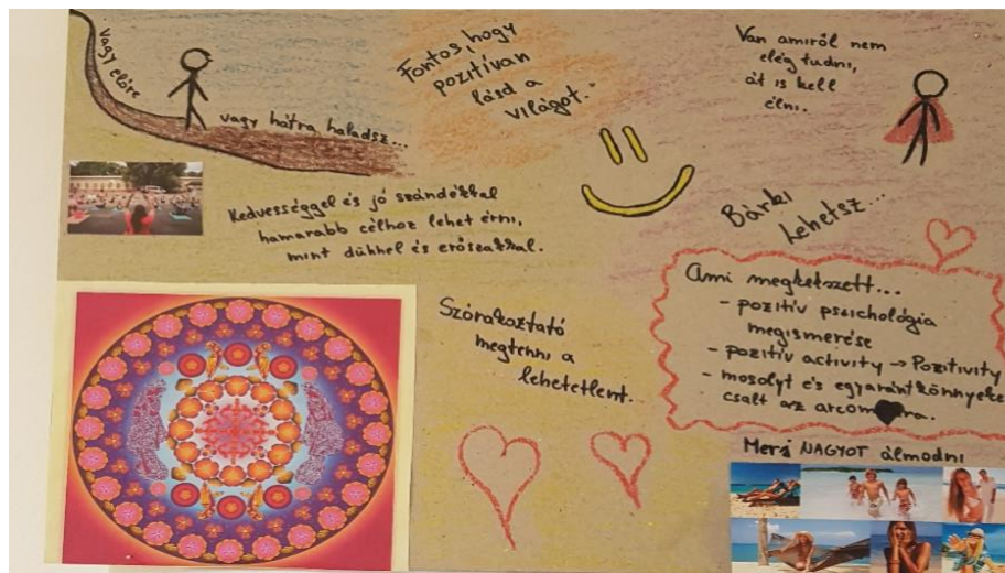
Figure 6.: Montage by students entitled: What do I take with me from the course?