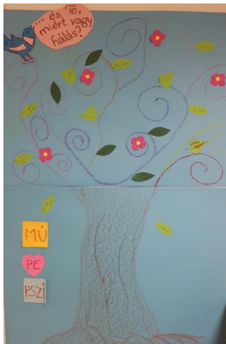
Figure 4.: Gratitude Tree made by students