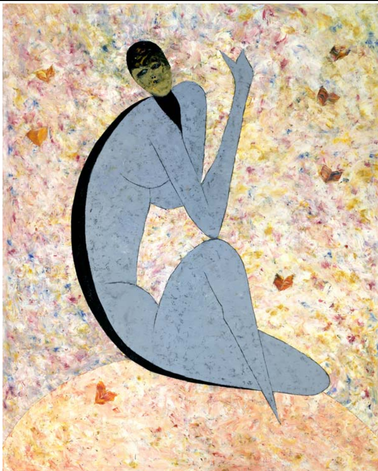
Flessler Lajos festménye