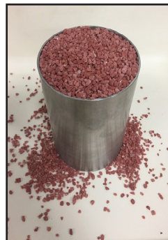
Figure 3. Determination of bulk density