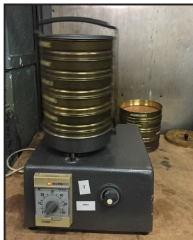
Figure 2. Sieving