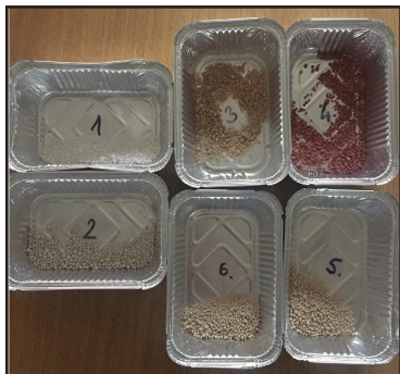
Figure 1. Fertilisers after drying