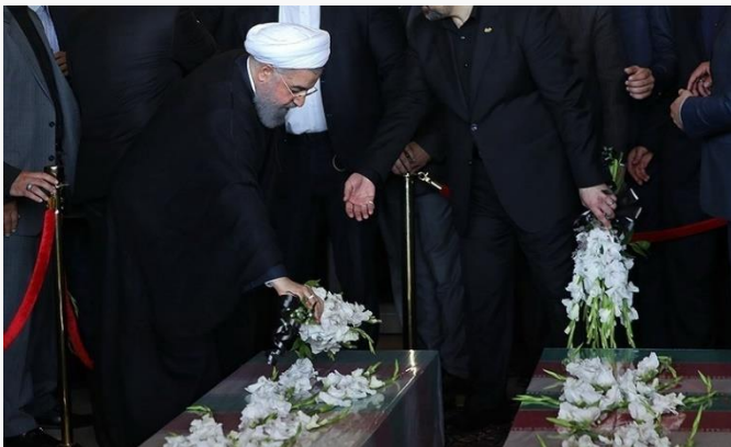
President Hassan Rouhani provides a tribute to the victims during the 9 June 2017 funeral.

■ On 7 June 2017, two terrorist attacks were simultaneously carried out by five terrorists against the Iranian Parliament building and the Mausoleum of Ruhollah Khomeini in Tehran, Iran. 17 people dead and 43 others wounded. These attacks were the first terrorist attacks in Tehran in more than a decade. The first major terror attacks in the country following the 2010 Zahedan bombings.