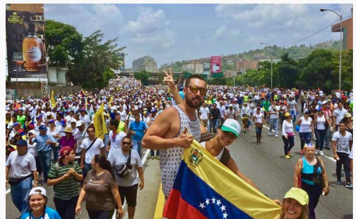
Opposition protesters holding a Venezuelan flag during a protest in April.

government sympathisers, bystanders and security forces. Hundreds have also been hurt or arrested.