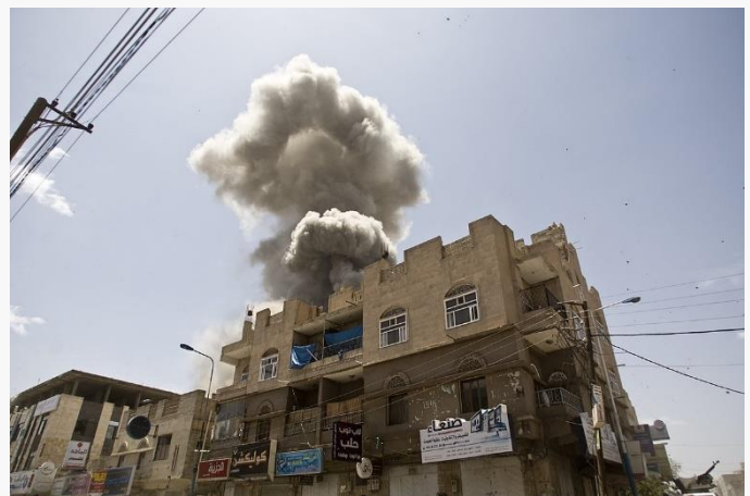
Aerial bombardments on Sana'a, Yemen in March 2016.

and other key points. During the house arrest of government, the president, Hadi was able to escape from Yemen the Houthis wanted to push their advantage and to take control the entire country.