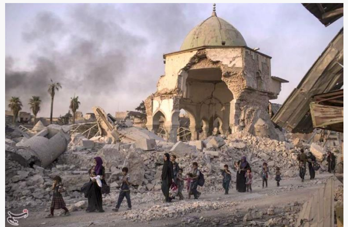
Great Mosque of al-Nuri in Mosul after retaking from ISIS.

Muslims globally mourned the destruction of the Grand Mosque of al-Nouri, built in the 12th Century and a treasured religious heritage site. The Mosque was seized in 2014 by the jihadists and is thought to have hosted the first and only public appearance of Isil Leader Abu Bakr al-Baghdad when he declared his own “new caliphate” on June 29.