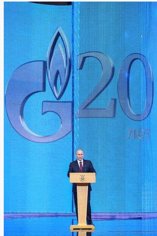
Vladimir Putin at gala evening celebrating Gazprom's 20th anniversary.

It remains unclear whether other major financiers will pull-out of the project in the wake of the threats. An inevitable waiting game and a dependence on the market perception of any resulting concrete measures will certainly force energy companies to weigh-up the pros and cons of abandoning a project where major capital has already been invested.