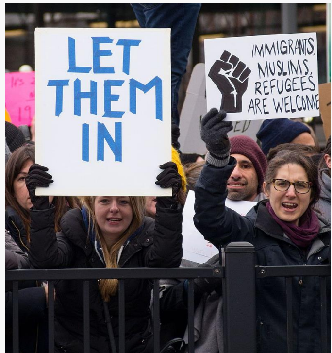
Protest against Donald Trump's executive order banning citizens of seven countries from traveling to the United States.

■ The Trump administration introduced a new travel ban applied on citizens from Libya, Syria, Iran, Somalia, Yemen, and Sudan for 90 days, that attempt to enter the United States with a valid visa. The bill additionally excludes refugees from entering the US for 120 days. The "travel ban 2.0" was introduced on 29 June after US president Trump's first attempt was ruled illegitimate by the US Supreme Court in March 2017. The state of Hawaii already filed an emergency motion to set the new travel regulation under investigation by a federal court.