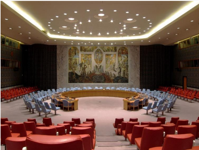
United Nations Security Council in the United Nations Headquarters in New York City.

■ During the 71st session of the United Nations General Assembly, on 2 June 2017 the new, five non-permanent members were elected to serve terms of two years each in the UN Security Council. These members, ensuring the geographical representation are Côte d'Ivoire (Ivory Coast), Equatorial Guinea, Kuwait, Poland and Peru. The (new) members of the Security Council are dedicated to maintain international peace and security with the help of legally binding decisions, with the help of power to