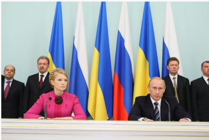
Prime Minister Vladimir Putin held negotiations with Ukrainian Prime Minister Yulia Tymoshenko in Moscow, following which Gazprom and Naftogaz Ukraine signed a contract for the sale and purchase of natural gas for 2009-2019.

■ In a distinct break from Europe Ukraine has formally established an offensive against the Russian-backed Baltic Sea pipeline, Nord Stream II, in a move which strikes an unusual alliance with Washington.