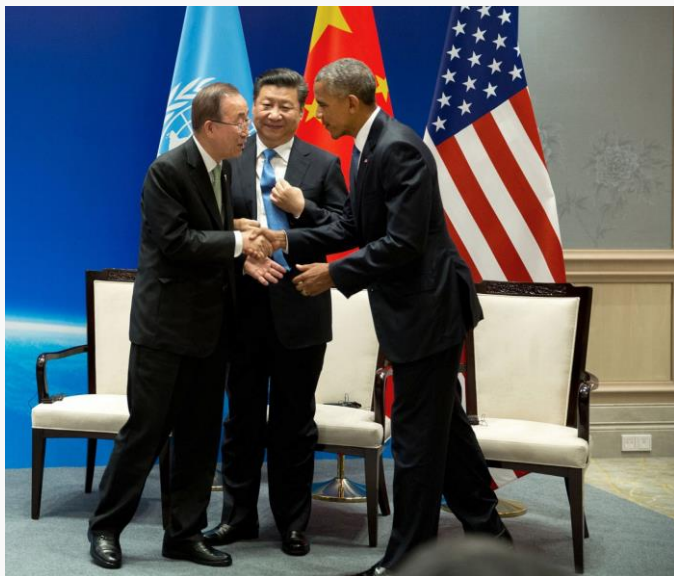
Barack Obama, Xi Jinping and Ban ki-Moon exchange greetings at the conclusion of a climate event in 2016.

■ On 1 June 2017, the United States' government announced to leave the Paris agreement, a climate accord on environmental protection signed by 195 states across the globe on 12 December 2015. The Paris accord is based on the United Nation's Framework Convention on Climate Change (UNFCCC) and intends to decrease the effects of global warming by keeping the rise of the global temperature below two degrees Celsius. The agreement operates under the framework of enabling each signing country to decide about the contributions and targets they are willing and capable to achieve. The commitment is hereby neither binding nor enforceable.