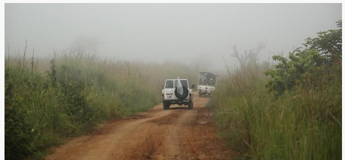
MONUSCO vehicles in the Democratic Republic of Congo in 2013.

Congo is a leading country in the world on producing cobalt with more than 80 million population and struggling with civil wars since the fall of military dictator Mobutu Sese Soko who was ousted in 1997 by a coalition of rebel groups.