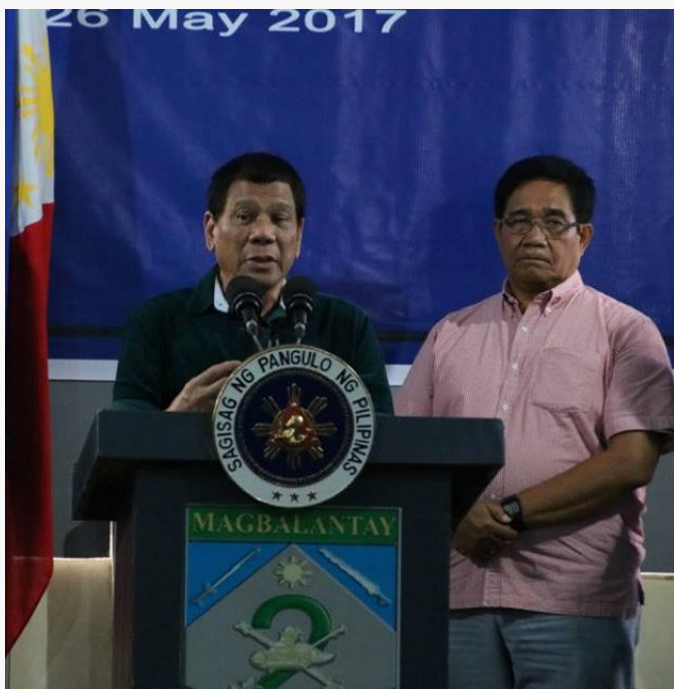
"We will fight everyday until this conflict is resolved," President Rodrigo Roa Duterte says to the men of the 2nd Mechanized Infantry Brigade in Iligan City on 26 May 2017 during his talk to men.

According to the Kyodo agency, the Speaker of the State of the Philippines, Ernesto Abella, said at a press conference that it would take about four weeks to kill 257 militants.