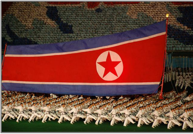
North Korea — Pyongyang, Arirang (Mass Games).

On 7th February , North Korea managed to launch a satellite into space which was claimed to be a “complete success”. The launch of the Kwangmyongson-4 satellite, which was named after late leader Kim Jong Il, was personally ordered and directed by Kim Jong-un. Despite the fact that North Korea is indicating that the launch was for “scientific and peaceful reasons”, many countries consider it a disguised ballistic missile test, especially because of the purported hydrogen bomb test which was carried out by the DPRK in January.