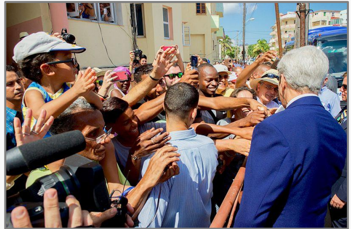
Secretary Kerry Meets With Cubans Standing Across the Street From the Embassy in Havana.

One last remark should be made regarding the recent peak in Cuban migration to the USA, which has tripled since 2014. Cuban citizens are motivated by fears that the