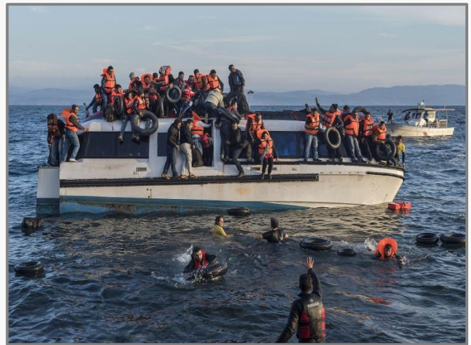
Syrian and Iraqi refugees arrive from Turkey to Skala Sykamias, Lesbos island, Greece.

Since 2015 , a rising number of migrants have travelled from Western and South Asia, Africa and the Western Balkans across Mediterranean Sea or through Southeast Europe. Many of which are seeking asylum and better living conditions because of bomb attacks and war in their home countries. Most of these displaced people, according to the United Nations High Commissioner for Refugees, originate from Syria, Afghanistan and Iraq. Since April 2015 the term “European refugee crisis” has become widely used as a result of the sinking of 5 boats in the Mediterranean Sea and the death of more than 1,200 migrants. On the 8th of February, 27 migrants died whilst trying to reach the Greek island of Lesbos. The International Organization for Migration (IOM) claimed that from the beginning of 2016 approximately four hundred people died; most of whom had been travelling to Greece in an attempt to later reach northern Europe. There are many routes by sea and on land used by migrants to enter Europe; the western African route, the central Mediterranean route, and the current most popular Western Balkan route which consists of passing from Greece through Macedonia and Serbia to Hungary or Croatia.