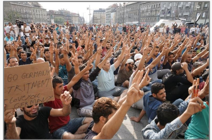
Syrian refugees strike in front of Budapest Keleti railway station.

answer to this problem is cooperation and reinforcement of the notion that is now Europe's responsibility to help these people by providing them security, housing and better living conditions.