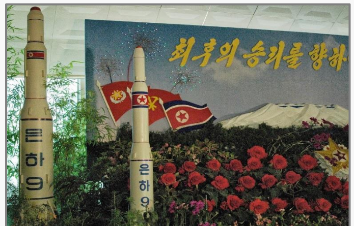
A model of the “Unha-g” missile on display at a floral exhibition in Pyongyang.

Wright to be the satellite and the third stage of the rocket booster. He said in a statement that if North Korea manages to communicate with the launched satellite it will learn about the ways of operating it in space, adding that even if it won’t be able to do so, at least the country will learn about “the reliability of its rocket system”. An analysis by Japan indicated that parts of the rocket fell into four different locations after the take-off. According to the Japanese Prime Minister’s office the first location is 150 km west of the Korean Peninsula in the Yellow Sea; following by two other locations to the southwest of the Korean peninsula in the East China Sea, and finally the fourth location is situated about 2,000 kilometres south of Japan in the Pacific Ocean.