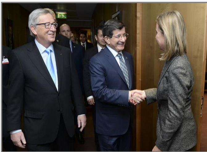
Federica Mogherini and President Juncker meets Prime Minister Davutoglu.

Finally they agreed to seek NATO's help for vigilance the situation at sea. In spite of talks, Turkey closed its borders to 30,000 migrants, ignoring EU recommendation to allow the refugees to enter. In Turkey, both pro-government and opposition parties have criticised the EU for demanding they open their borders to Syrian refugees. Turkey is trying to balance between reducing the number of migrants travelling to Europe whilst also allowing Turkish aid workers to set up tents and provide the refugees with shelter, food and medical assistance. Erdogan said that he was their brother but now they have nowhere to go.