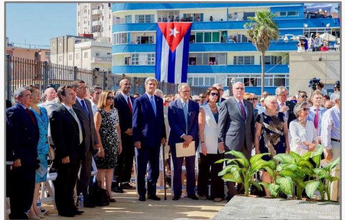
U.S. Secretary of State John Kerry at the newly re-opened U.S. Embassy in Havana, Cuba.

The future meeting between Obama and Castro has been highly criticised by Republican candidates Ted Cruz and