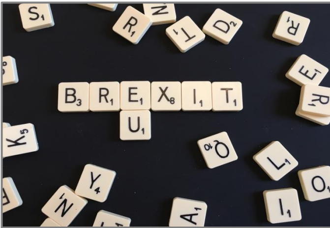
Brexit / EU Scrabble.

As the “Brexit” referendum in June edges closer, Prime Minister David Cameron has been in negotiation with the European Union in an attempt to secure his demands for reform. Cameron is demanding a “special status” for the United Kingdom which would ensure protection through majority vote in London against the imposition of demands made by Eurozone states. In addition, the Prime Minister seeks to ensure that Britain is excluded from the EU notion of “an ever closer union” and further aims to secure more power for national parliaments to block EU legislation.