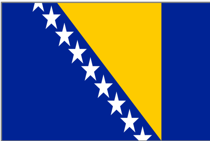
Flag of Bosnia and Herzegovina.

■ Air strikes in support of Syrian President Bashar al-Assad and the Russian role in neighbouring Ukraine with the annexation of the Crimean peninsula in 2014 have caused a change in the communications between Russia and Western countries. The Russian Prime Minister Dmitry Medvedev says that a new cold war is on. However, Jens Stoltenberg, Secretary General of NATO, in an interview with BBC at Munich conference says that "we are not in a cold war but also not in the partnership that we established at the end of the cold war." NATO's aim is to increase the political dialogue with Russia. Regardless of such claims, Russia justifies its continued aerial bombardment as a mechanism to stop extremist groups from reaching Russia.