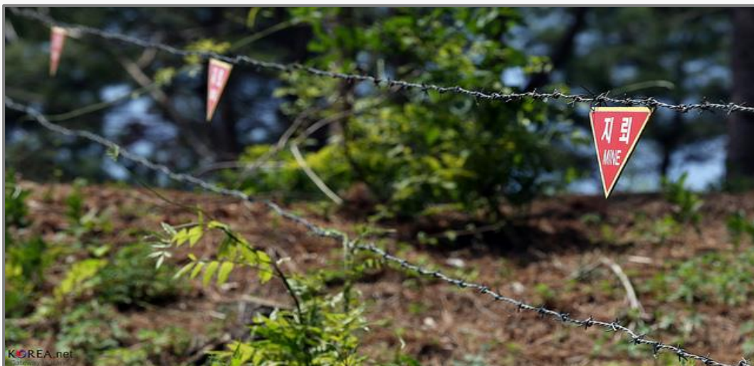
Korea_DMZ_Train_26.

According to a South Korean military official a North Korean patrol boat crossed into South Korean waters in the first week of February. It was reported by a news agency that despite warning communications from the South Korean navy the boat did not leave the area, it only retreated after a couple of warning shots were fired by a naval gun. The so-called Northern Limit Line, which was crossed by the North Korean boat, was drawn up at the end of the Korean War, but North Korea has refused to acknowledge it ever since. The incident came in a time when tensions are constantly heightening on the Korean Peninsula, since it came the day after North Korea fired a long-range rocket carrying a satellite into space, which other countries, including South Korea, consider as a disguised missile test.