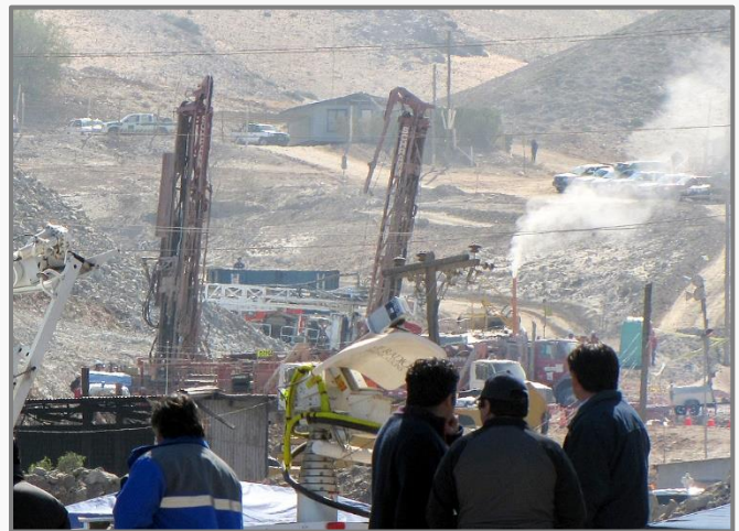
Mine in Peru.