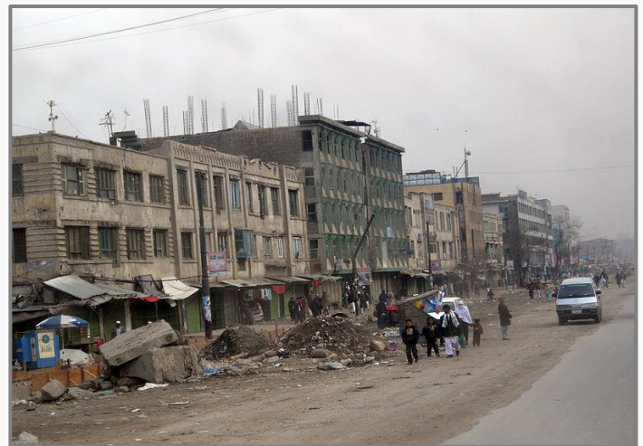
Kabul Downtown.