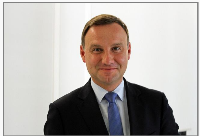
Andrzej Duda.