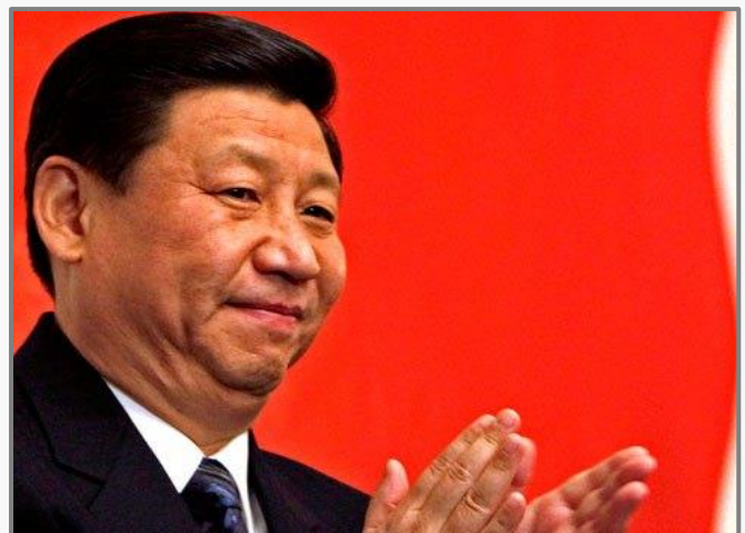
Xi Jinping.