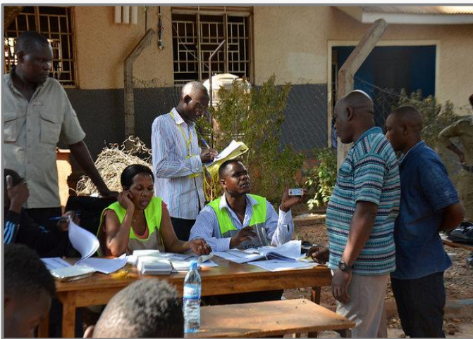
Election day in Uganda - 18 February 2016.