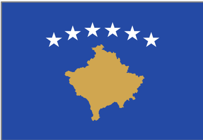
Flag of Kosovo.

Kosovo opposition lawmakers sparked uproar after releasing tear gas during a Parliamentary session on Friday 19th February. In spite of security checks, the opposition managed to smuggle the gas into the chamber and as a result managed to suspend normal proceedings twice that day. Consequently, 18 MP's were banned from Parliament, 7 MP's were arrested and four members of the opposition had to be forcibly removed by the police. Discontent has been brewing amongst the opposition as a result of the current EU supported deal between Kosovo and Serbia regarding greater powers to ethnic Serbians residing