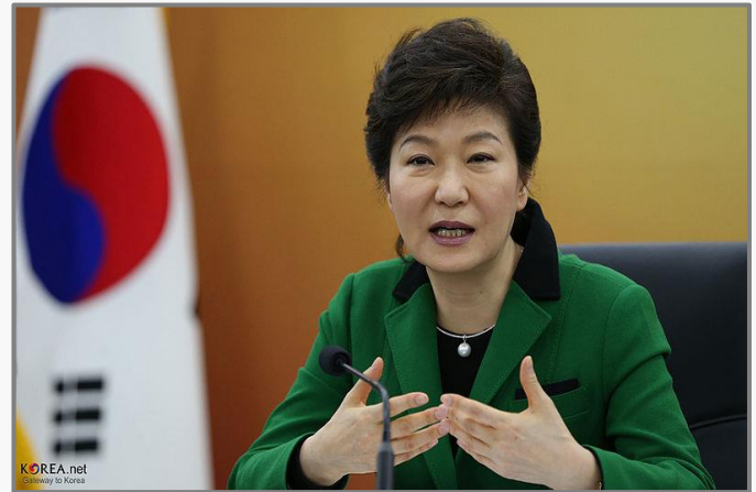
President Park Geun-hye.

South Korean President Park Geun-hye identified the launch as a “challenge to world peace” and he also announced the country would like to begin a series of talks with the United States to deploy a defense system called Terminal High Altitude Area Defense (THAAD) which is able to intercept missiles in flight. If the system was deployed to South Korea it would only be focused on North Korea, but other nations, such as China and Russia are afraid that if the US decides on the deployment of THAAD then it could be used against them as well. Besides the planning of the deployment of THAAD South Korea is considering the reduction of the personnel at the Kaesong