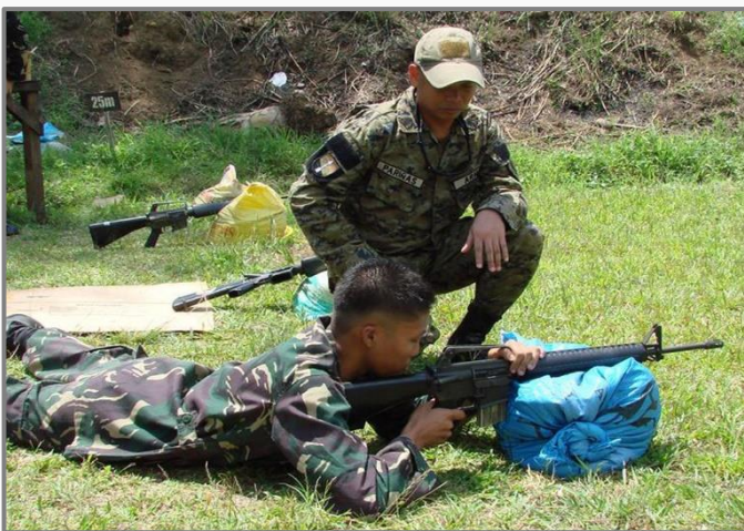
A soldier of the 1st Scout Ranger Regiment of the Philippine Army.

■ Prior to the Chinese New Year, the President Xi Jinping has reasserted the importance of economic and military reforms and has called for commitment in its implementation. This push for reform was put forward during Jinping's visit to Jiangxi, a southern Chinese province. Among other statements, Xi Jinping made reference to its government's commitment to develop the old revolutionary base areas in order to tackle poverty. Due to the stagnation of economic growth for the past two years, the province of Jiangxi was also encouraged to support up-and-coming industries and to modernize traditional ones. Regarding the military, Jinping is enforcing a reform which has led to the sacking of 300,000 people so far. However, the President highlighted the importance of people's devotion to these reforms, calling for the cooperation of the Chinese people.