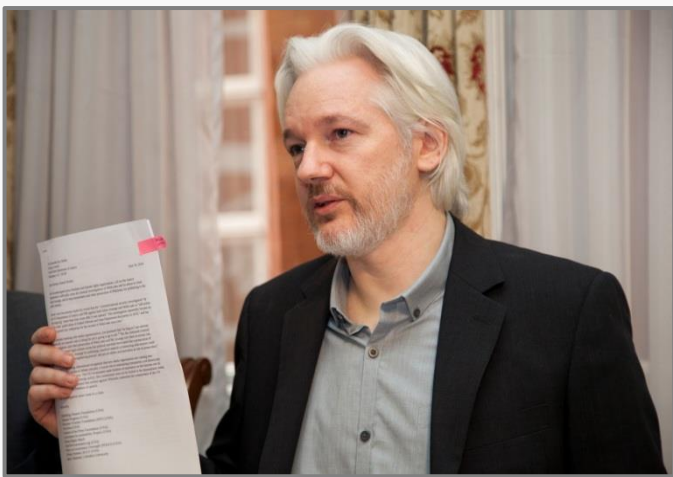
Julian Assange holding a press conference.

A UN panel ruled on the 5th of February that Julian Assange, WikiLeaks founder, had been arbitrarily detained and should be granted compensation. The famous hacker who leaked hundreds of secret US files had sought protection in the British Ecuadorian Embassy since June 2012 in order to avoid a Swedish rape investigation. Assange claims that the accusation of a 2010 rape in Sweden is false and is in fact a masked conspiracy which aims to eventually push him back to the United States where he would face a criminal investigation regarding his role in WikiLeaks. Despite lack of unanimity amongst the UN panel, the