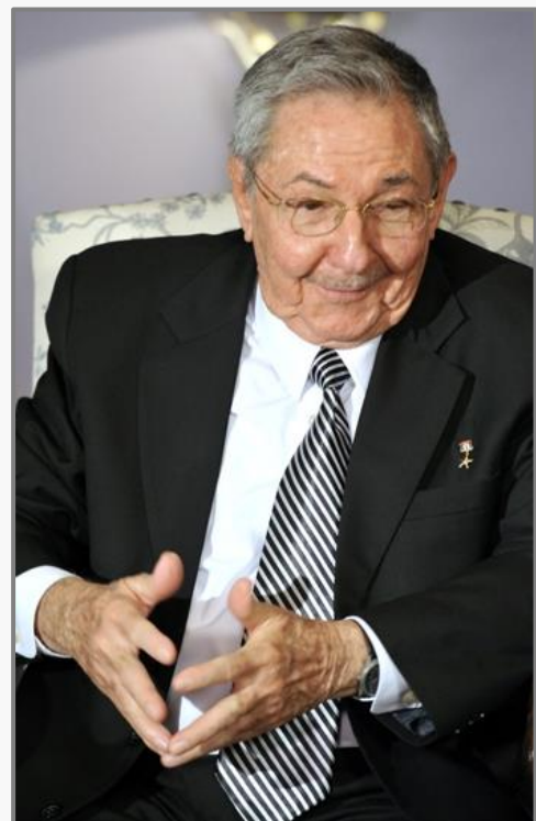
Raúl Castro.

The European Union being a primarily economic alliance, the consequence of closer ties will be an increase in the volume of trade and investment to the island. The EU counts as Cuba's second most important trading partner after Venezuela and largest external investor. Europe cannot be ignored in terms of tourism either as one third of tourists visiting Cuba comes from the old continent. Foreign Minister Bruno Rodriguez stated at a news conference that diplomats will work with Brussels to determine the details and dates for further negotiations. A new bilateral agreement was agreed to be signed in 2015.