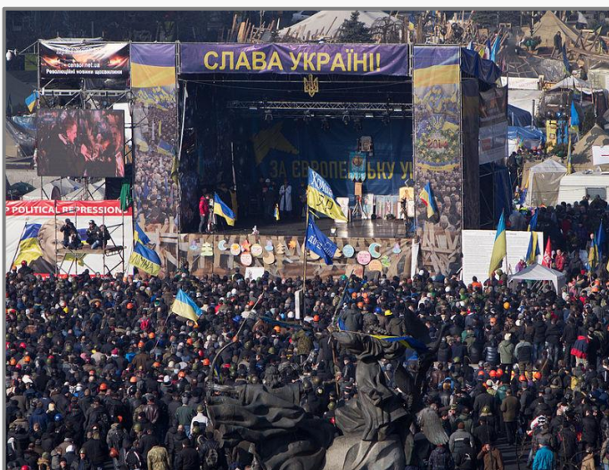
Euromaidan in Kiev, 21 February 2014.

After being forced from power he eventually fled Kiev to Russia 22 February. Nevertheless, many claim that even though he left the capital, the dysfunctional nature of governance and political rivalry in Ukraine persist, led by the same regime for the past twenty years. Evidence for the latter is the return of Yulia Timoshenko to the political realm. The main rival of the ex-president was released from prison on the day Yanukovich was overthrown. The country's new cabinet presented itself for Maidan's "approval" on the evening of February 26th and announced new elections to be held on 25th May.