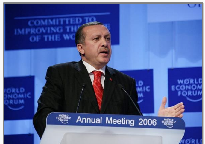
Recep Tayyip Erdogan.

In response, Turkey has expressed uneasiness over EU officials' statements, and urged officials to be more conscious when making statements about the country's internal affairs, especially those with political nuance. Minister of European