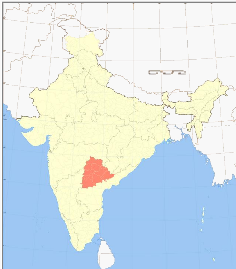
Telangana within India. Map: Wikimedia Commons