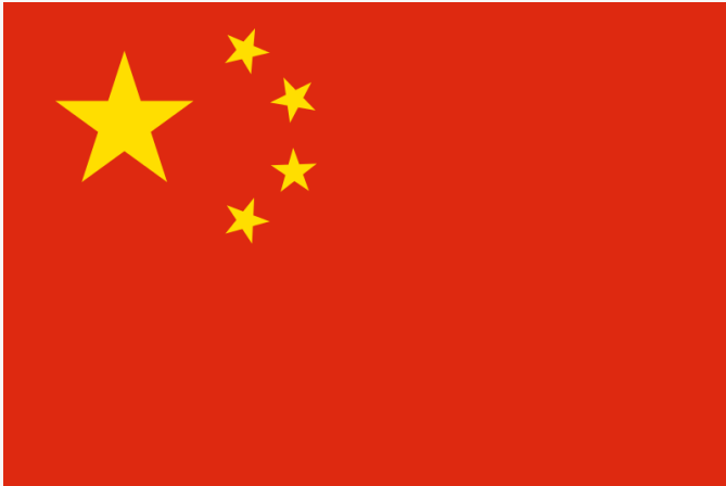
Flag of China.

and officials” which is well-supported by the Chinese Foreign Ministry. The sanctions appeared as the next step in the long-running demand by Hong Kong: 4