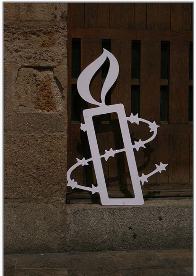
Amnesty International.

recommendations in order to stop unlawful killings and violation of human rights and humanitarian law. For instance, the non-governmental organisation urged Israeli forces to refrain from deploying lethal weapons unless it is unambiguously necessary. The report also called on the international community, such as the USA and the European Union, to suspend the transfer of various weapons, munitions and