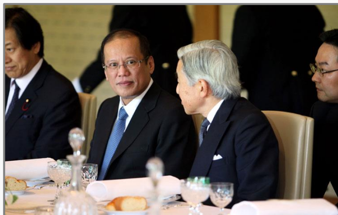
Benigno Aquino III.

Aquino has been president for 4 years now, and has “exceeded expectations” so far. He was a “low-key senator”, but after the death of his mother he was voted for presidency “by a wave of national sympathy”. The administration has fought and also reduced corruption, and “finally address[ed] an impediment to commerce”. More roads are paved; all major credit-rating agencies give the country “an investment-grade rating”; negotiations ended up in a major peace