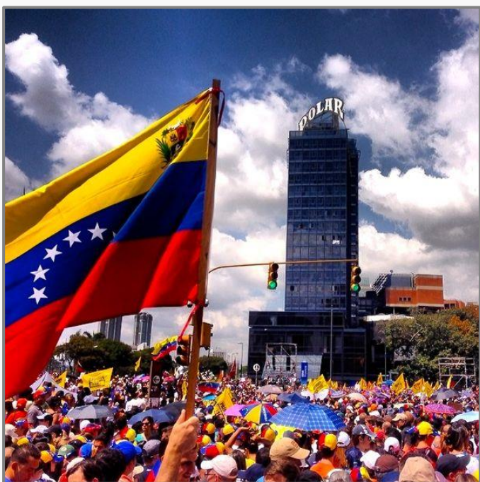
Peaceful protestors demonstrating in Caracas, Venezuela.

thereby the improvement in the quality of life of many Venezuelans is undoubtedly something the society can be grateful for to the Chávez regime, there are multiple concerns Venezuela is facing, which eventually led to violent protests. Among the reasons are the country's crucial security situation; high murder rates; the shortage of basic commodities; constant corruption; price inflation of more than 50% in a year caused by strict price control and the demand from the opposition to take part in public dialogue.