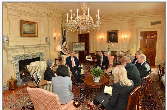
U.S. Secretary of State John Kerry meets with the family of Kenneth Bae at the U.S. Department of State in Washington, D.C., on January 28, 2014.

Outside observers has pointed to the recent “tone down” in the rhetoric of North Korea towards South Korea, and think this is for the “improved ties with the outside world in order to attract foreign investment and aid”.