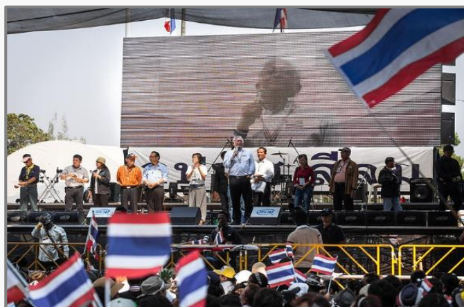
Suthep Thaugsuban holds a speech on the day of the general elections at the Silom anti-government protest site.

The anti-government protests have been led by the main opposition Democrat Party, particularly by former MP Suthep Thaugsuban. After the closure of several government offices caused by the protesters, all Democrat Party MPs resigned on 8 December 2013. Therefore, Prime Minister Yingluck had to dissolve the House of Representatives and announce general election for 2 February. Owing to spreading violence, shootings and blockade of major road intersections in Bangkok, the government declared a state of