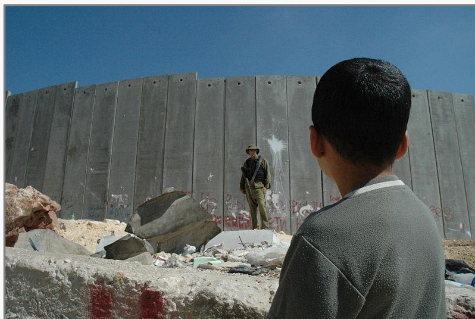
A Palestinian boy and Israeli soldier in front of the Israeli West Bank Barrier.

Although it is difficult to examine which side is impartial and which is not, the report is undoubtedly studying a highly-relevant issue. On 27 February, Israeli soldiers killed a Palestinian man in Bir Zeit, a town in the central West Bank. The Israeli and Palestinian media has commented on the circumstances quite controversially. According to Israeli media sources, two Palestinians were arrested when the third person from the group hid in a house, resisted arrest and forced Israeli troops to shoot him. On the other hand, Palestinian media was referring to witnesses who told that the man was shot in the head. According to these reports, an assault rifle was also found in the house but Palestinian sources suggest that it had not been fired at the Israeli forces.