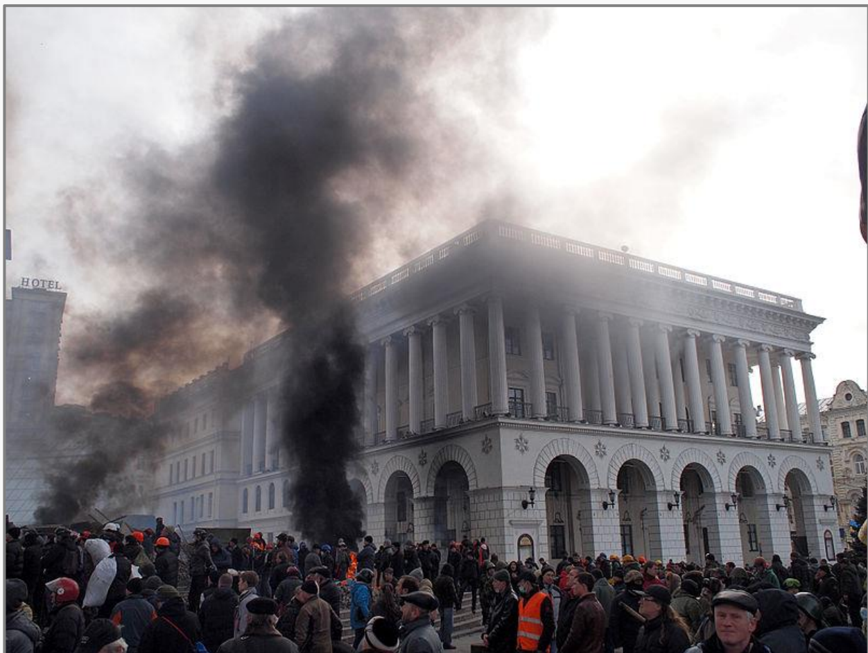
Euromaidan in Kiev, 19 February 2014. Protesters are burning tires near Kiev Conservatory.

parliament agreed to deploy soldiers to the peninsula, located south of the Ukrainian mainland and west from Russia. They argued the military presence was needed in defense of the area's ethnic Russians. Pro-Russian protestors occupied government buildings and the presence of troops from both countries made the situation extremely tense. Yanukovich held his first news conference since leaving the country, in which he claimed to remain president. Russia handed The Crimean Peninsula to Ukraine in 1954, which became the Autonomous Republic of Crimea within Ukraine after 1991.