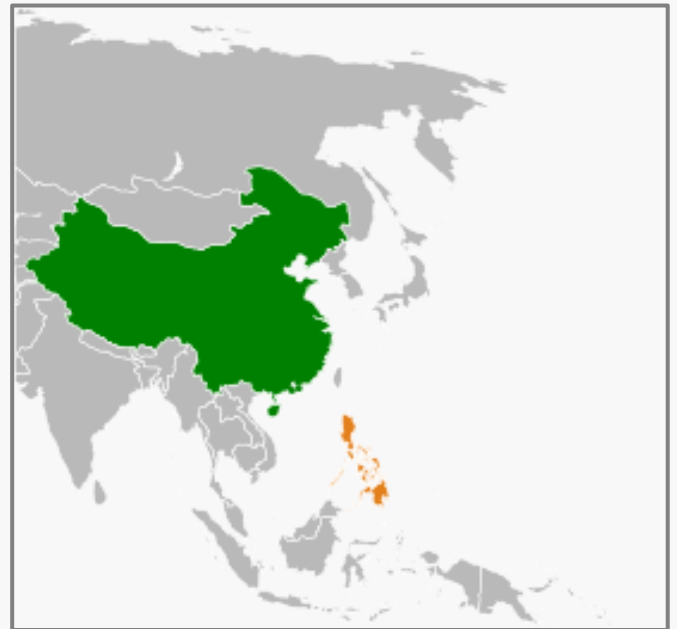
China and the Philippines. Map: Zuanzuanfuwa [Wikimedia Commons]

Although comments arrived later that the president had not want to offend China but only “answering a question with a historical fact”, the Chinese reaction was strong to the president’s remarks. The official Chinese news agency, the Xinhua declared that the president’s “approach [is] inflammatory and unfortunate”, “ignorant” and “amateurish”. China