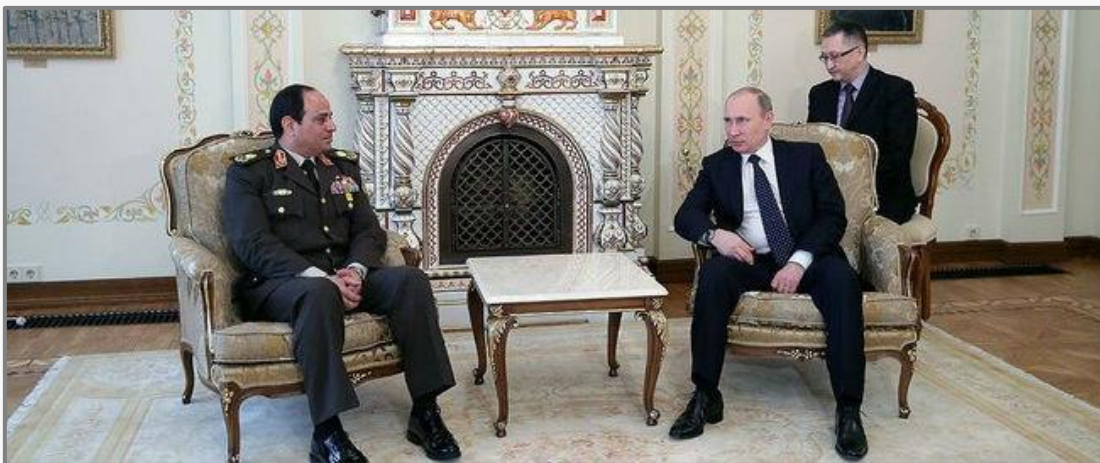
Russian President Vladimir Putin had a separate meeting with First Deputy Prime Minister, Minister of Defence and Military Industry of Egypt Abdel Fattah al-Sisi.