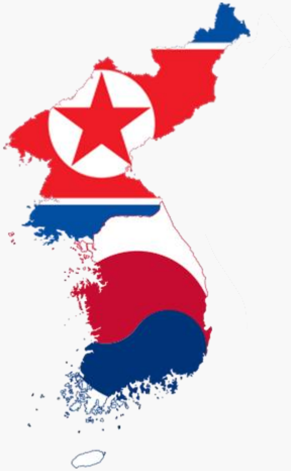
Flag map of Korea.