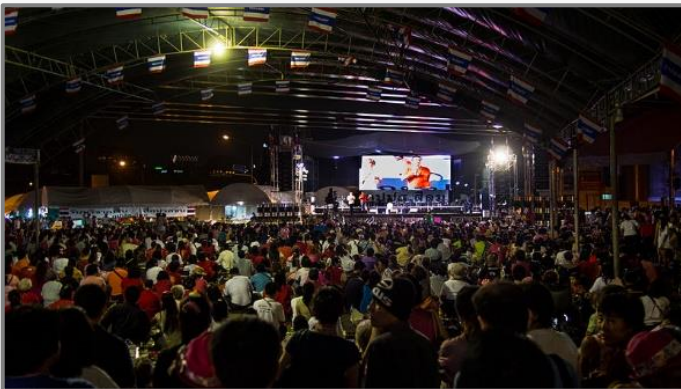
A crowd of anti-government protesters the day before the scheduled elections at the intersection of Silom road and Rama 4 road.

create voting opportunities for those citizens who were restrained by anti-government protests. Tension has not been lowered either after the general election. On 14 February, thousands of riot police were deployed in Bangkok to clear some of the occupied streets and areas of the capital. The police's actions were mainly focusing on governmental buildings and their surroundings. Actually it was not difficult to retake these areas since the number of protesters had been falling sharply since mid-January, the beginning of the 'occupation'. Moreover, this operation can be interpreted as a shift in the government's tactics since previously it allowed the protesters to camp out on Bangkok's streets for months.