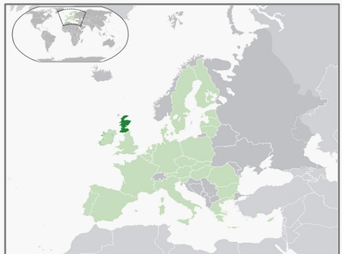
Scotland in the European Union.

Barroso mentioned the example of Kosovo in the eye of Spain which has not yet even recognised the new country. He feels that the situation with Scotland would be similar, but he does not want to interfere in any way, and the Scottish people have to decide about their own life.