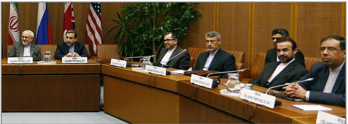
Iran Nuclear Negotiators, 18.02.2014.

and Iran has not only made an agreement on seven practical measures but one of these measures is specially dealing with the UN nuclear agency's inquiry into the possible military dimensions to Iran's atomic activities. According to a joint Iran-IAEA statement issued this month, Iran has already implemented six initial steps such as access to certain nuclear-related sites. Furthermore, Iran is also going to provide access to the Saghand uranium mine and the Ardakan uranium ore milling plant by 15 May. In addition, more information on the extraction of uranium from phosphates will be given by the country to the IAEA. In spite of this positive turn of events, the IAEA's statement does not mention the Parchin military site at all which has been