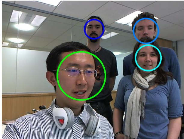
Figure 2 A robot's-eye-view of a conversational interaction

human interlocutors. The challenge was two-fold: designing a system (i) which is both simple in nature, and cost effective, while not equipped with speech recognition components, but (ii) which gives the illusion of intelligence. Our system does not emulate intelligence but uses common phatic and conversational devices to try to engage a human in a conversation without resorting to any complex information processing, using only utterance length information and synchrony of movement timing as well as body-movement (or head-movement) information to make inferences about the human participants dialogue acts.