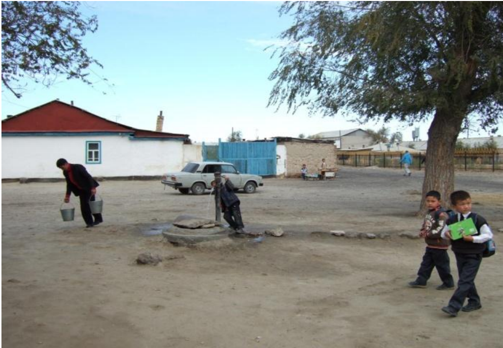
Picture 11. A Kazakh takes water from well

frequently contaminated by fecal organisms and chemical pollutants as in rural areas, sanitary facilities were often characterized by open latrines and untreated sewerage discharge into waterways. 87