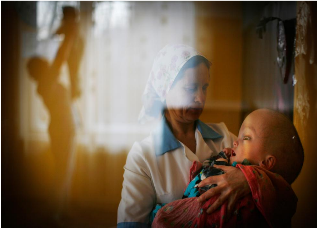
Picture 13. Nurse holds a two year old baby in a hospital in Semey, Kazakhstan

The Soviet government and its people were justifiably proud of post-war health records characterized by improvement in infant mortality, life expectancy, and overall mortality rates. The rapid development since the early 1930s of a system that provided universal access to primary health care services in local, cities and specialty services in regional centers was surely responsible in part for those achievements. Since the early 1970s, however, the state of the nation's health and, the quality of its health care system declined. In a country as developed and industrialized as the Soviet Union of the 1970s, these declining health indicators probably reflect a deterioration of general economic conditions. Health care, agriculture, and in fact all sectors of the economy suffered during the 1970s, a period of sluggish economic growth and deepening bureaucratization. Partly because of general declining standards, the early promises of the health care system were not sustained.