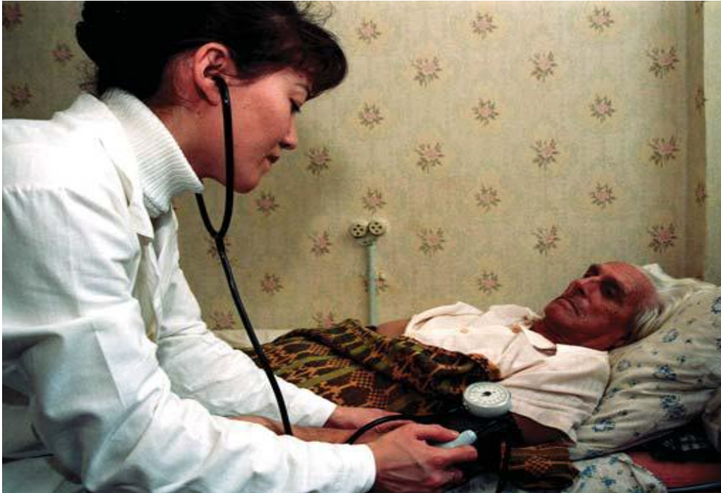
Picture 5. Local pediatric clinic, Almaty, Kazakhstan

collectivization campaign, industrial and educational developments and the States efforts 50 to undermine traditional healers and supplant them with biomedical workers was that allowed Kazakhs to take increasing advantage of clinical facilities where in sanitation education work also played an important role in this shift.