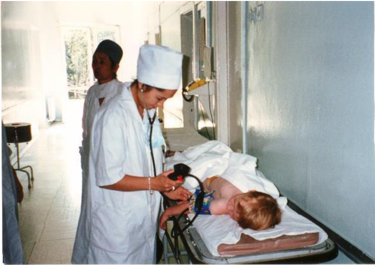
Picture 4. Local pediatric clinic, Almaty, Kazakhstan

practicing physicians, 39 while males retained most administrative positions in clinical facilities and medical educational institutions 40 (Picture 4).