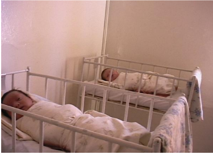
Picture 3. Babies in Children Hospital in Astana, Kazakhstan

As the ranks of medical cadres gradually grew, efforts were made to disseminate health and hygiene propaganda to the whole spectrum of population. 35 Sanitation education found expression in written, visual, and oral media. Activists appear to have relied most heavily on written means to convey their