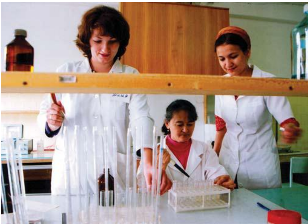
Picture 6. Kazakh/Russian medicos in TB testing laboratories in Kazakhstan

vaccinated since 1934, and from 1948 onwards anti-tuberculosis vaccination was made compulsory for all children, (Picture 6) and from 1961, all employees of medical establishments and some other professions up to the age of 30 were also vaccinated against TB. 56