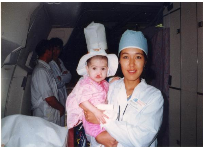
Picture 10. Health care facilities through ambulatory/flying hospitals

In USSR including Central Asia, unemployment, destitution and poverty have been permanently done away with on the basis of the abolition of the exploitation of man by man. In a remarkably short period of time the Socialist state succeeded in raising the material and cultural level of the entire population enormously, thereby laying a firm foundation for successful work in the field of public health. The Soviet Union wiped out slums and provided both town and country with water mains, sewer systems and electricity. In addition to this, the quality and quantity of the foods available were increased beyond all recognition. Nutritious food was made available to the entire population and its production and consumption increased constantly. The USSR by allowing the necessities of life to be supplied plentifully, and by providing decent leisure facilities, was able to improve peoples' psychological as well as material conditions, and hence allowed further improvement in health sector of the Union as well as that of people living there who got the facilities at various levels from that of the birth until their death 73 (Picture 10).