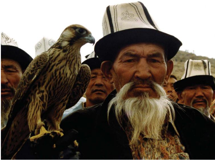
Picture 1. A Kazakh Shaman

The construction of Kazakh life as bright, clean and healthy was entrusted to medical cadres. Government and party officials believed that if medical workers succeeded in imparting this view to the Kazakhs, they would open the door to modernization and Europeanization of the region. It was because Central Asia including Kazakhstan was 'plagued with malaria, leprosy, polio, diphtheria, and tuberculosis before the Soviets took charge. The general mortality rate was 30.2 per 1000 inhabitants; infant mortality rate 272.0 per 1000 births. In 1913, average life expectancy was under 32.0 years, and 0.4 doctors were available per 10,000 inhabitants in Kazakhstan.' 14