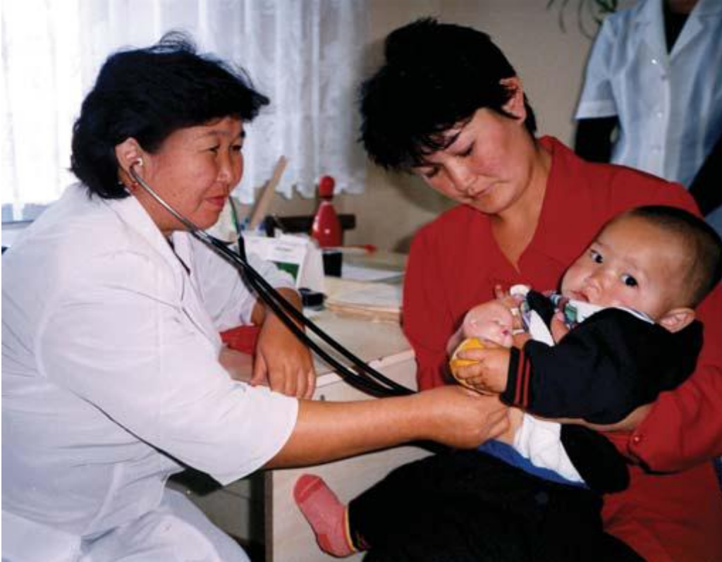
Picture 8. Child care facilities in Kazakh hospitals

The result was that the infant mortality dropped almost five times in the years between 1940 and 1960 even though the death rate of new-born babies, particularly premature ones, was still high. 61 General mortality declined by 71% and infant mortality by 90% at the close of 1960s 62 (Picture 8).