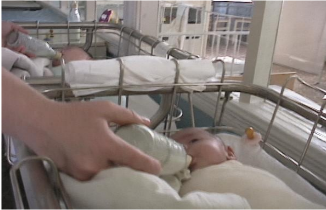
Picture 2. Group of nurses working with children to stimulate their development

being of newborns, while trumpeting the state's strides in expanding (Defense of Motherhood and Infancy) facilities 30 (Picture 2).