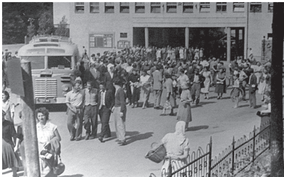
End of the shift. Borsodnásasd, 1960s