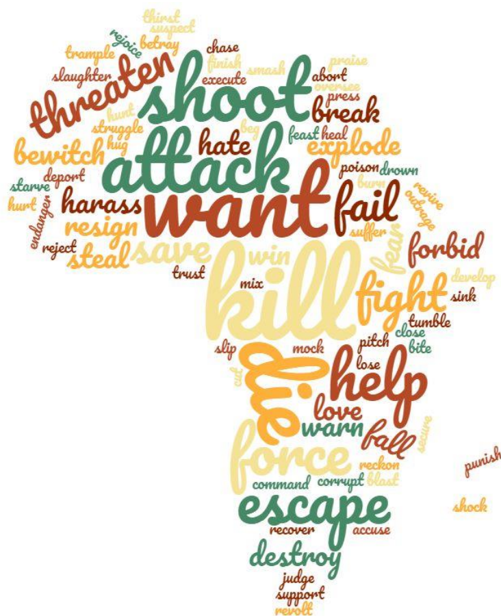
Figure 2. Africa's word cloud based on the sentiment analysis of verbs (direct translation of the original Hungarian verbs)

A total of 145 sentiment verbs can be classified in the remaining titles. 79% of them are negative and 21% are positive. The verbs were first extracted in their original forms, then all of them were transformed into 3 rd person singular, and lastly, a separate column was dedicated to the verb stems. The verbs and their frequencies are presented in the form of a word cloud for better illustration. In most of the cases the verb stems were used, except for verbs, where the meanings are modified by the prefixes (e.g. lemond vs. mond – to resign vs. to say) or in cases, where the stems are rarely used on their own (e.g. meghal vs. hal – to die).